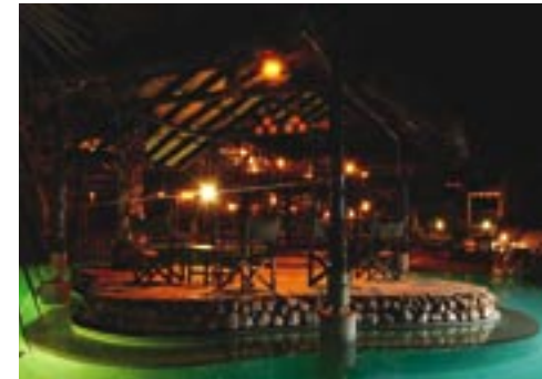
Sarova Shaba, Samburu Game Reserve, Northern Frontier, Kenya