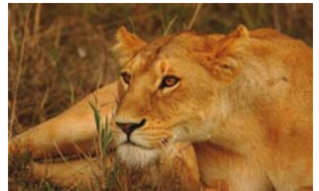
Lioness at rest, Serengeti Plains, Tanzania