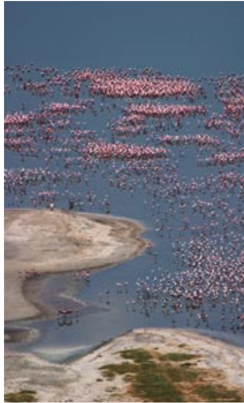
Flamingoes on Lake Nakuru, Kenya