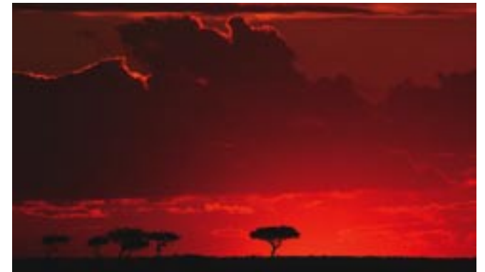
The Plains of the Masai Mara National Reserve, Kenya