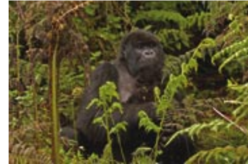
Mountain gorilla, Parc National des Volcans, Rwanda