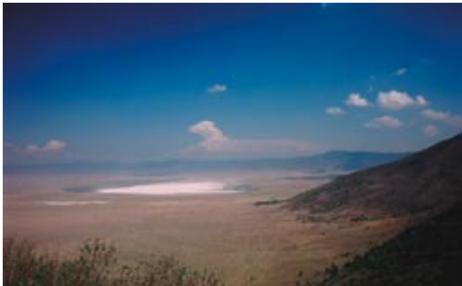
Ngorongoro Crater Conservation Area, Tanzania