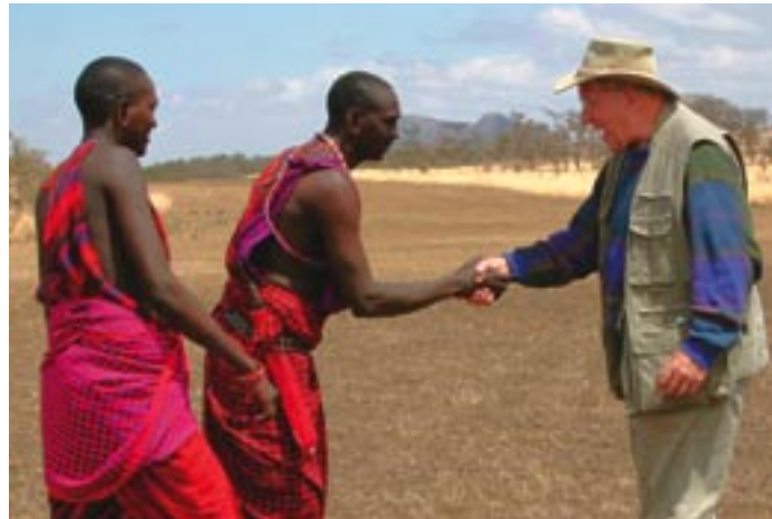
Greeting the elders, Chyulu Hills, Kenya