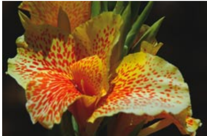
Kenyan Canna Lily, Masai Mara, Kenya