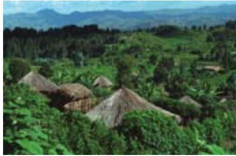
Near Bwindi Impenetrable Forest, Uganda