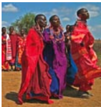
Maasai dancers, Amboseli, Kenya