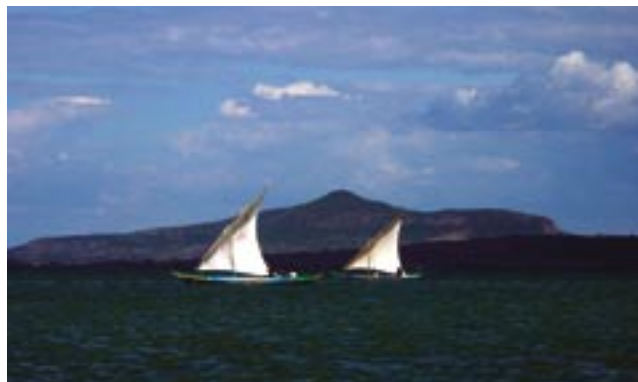
Dhows sailing on Lake Victoria, the borders of Kenya, Tanzania and Uganda