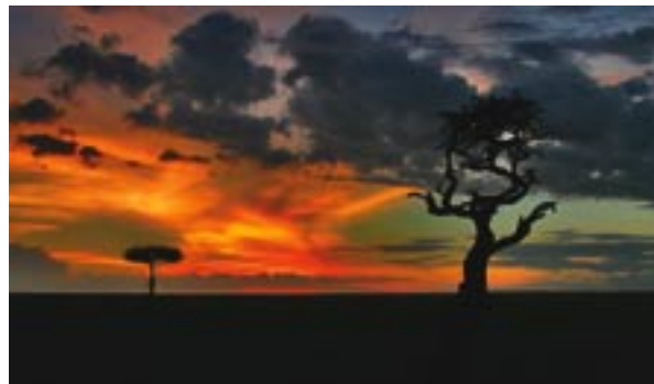
A Masai Mara sunset, Kenya