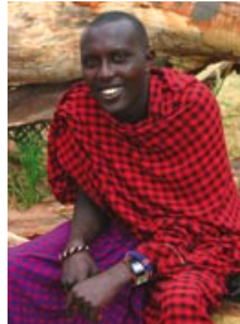
Maasai elder, Chyulu Hills, Kenya