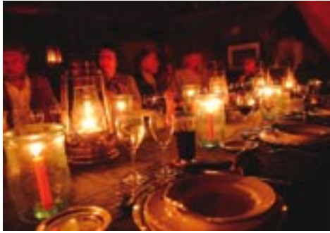
Candlelight dinner at Campi ya Kansi, Chyulu Hills, Kenya