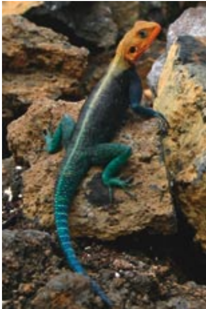
Agama Lizard, Amboseli, Kenya